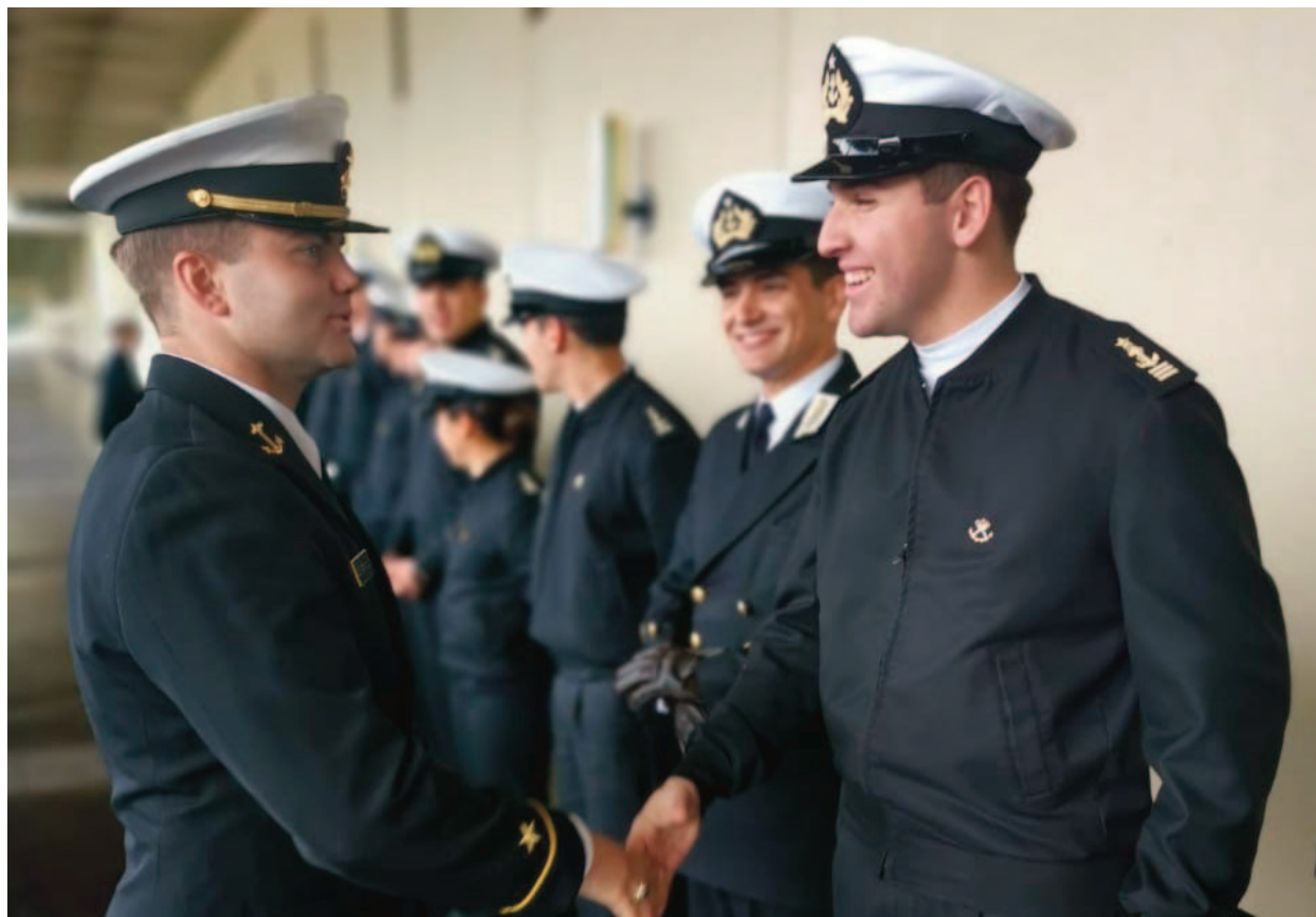
Midshipman at the Escuela Naval Arturo Prat in Valparaíso, Chile