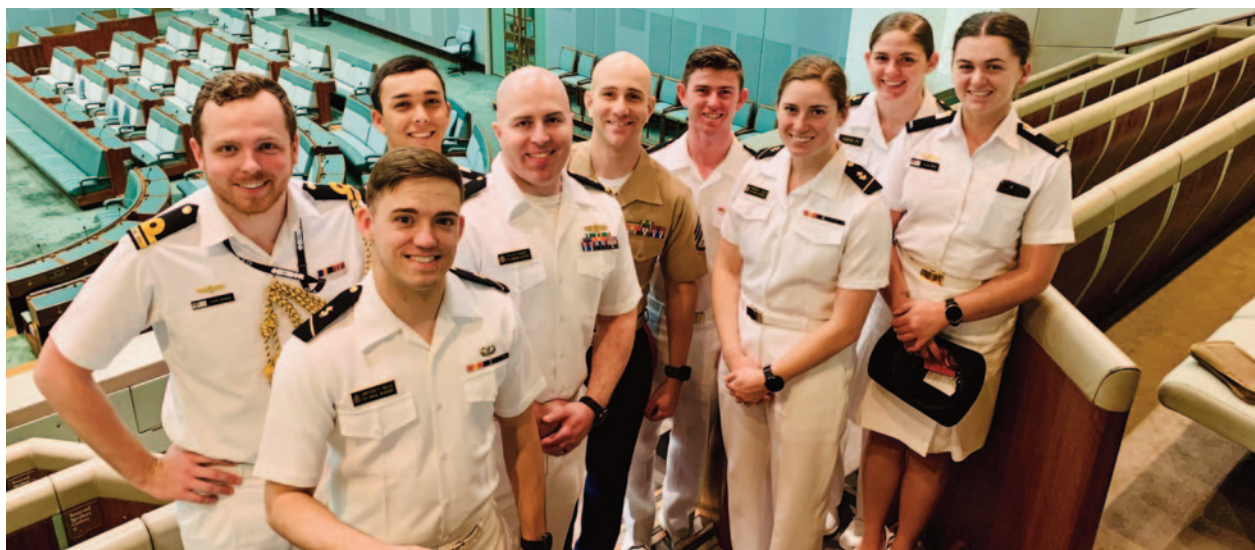
USNA and members of the Australian Defence Force Academy at the Australian Parliament

Finally, the shared experiences with the Australian midshipmen forged bonds that will continue into the fleet. These interactions were the key resource in learning everything about the culture, way of life and the structure of the Australian Defence Force Academy. The entire experience provided all involved the ability to meet new people and shift their perspective on the international alliances that they will continue to build in their future as Navy and Marine Corps officers.