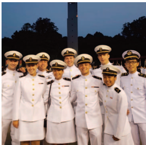
Singaporean Officer Candidate School Graduation

Some of these programs are reciprocal, meaning that midshipmen study with counterpart naval academies in countries such as Canada, Chile, France, Germany, Israel, Italy, Japan, Portugal, Singapore, South Korea and Spain. As the Semester Study Abroad Program continues to grow, IPO expects to send midshipmen to Austria, Australia, Brazil, Ireland and Peru within the next few years. The following programs are just a few examples of the semester study abroad opportunities from this past academic year.