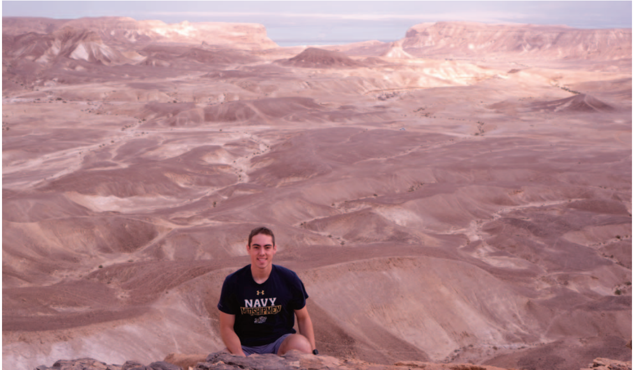
Midshipman overlooking the Dead Sea