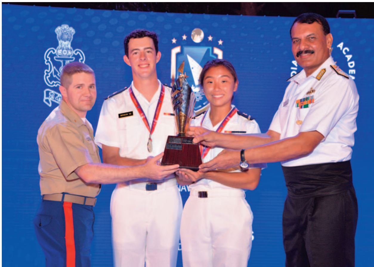
Midshipmen receiving their trophy after competing at the 10th Admiral's Cup Sailing Regatta in India