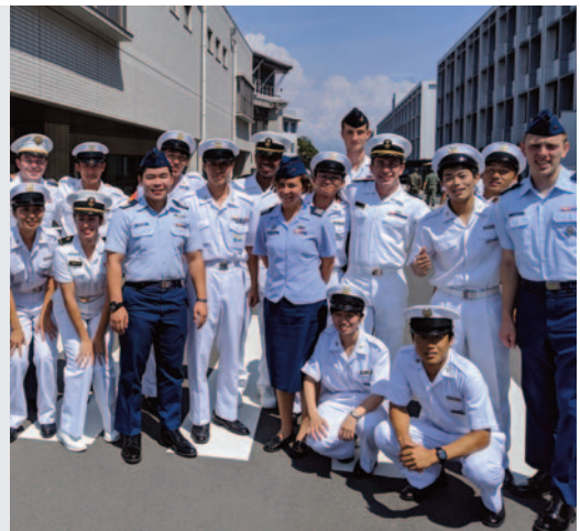
Group photo of USNA midshipmen with the other semester exchange students and their hosts at Japan's National Defense Academy