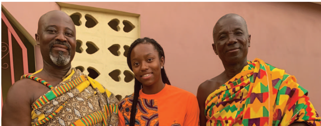
Midshipman visiting with locals in a market in Accra, Ghana