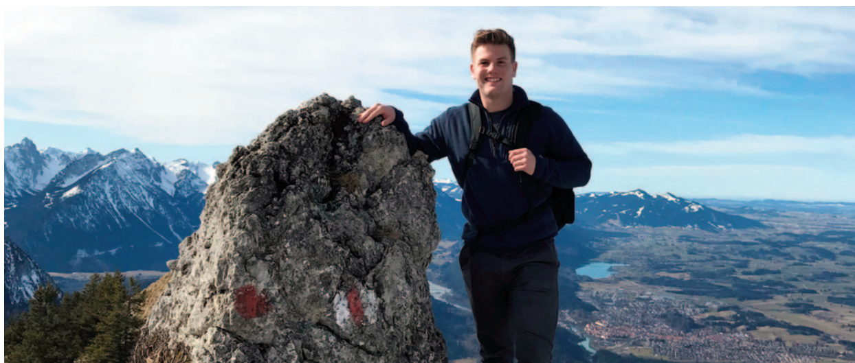
Midshipman hiking the German Alps