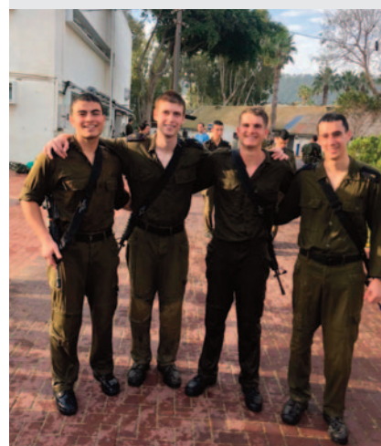
Midshipmen with classmates during training while studying in Israel