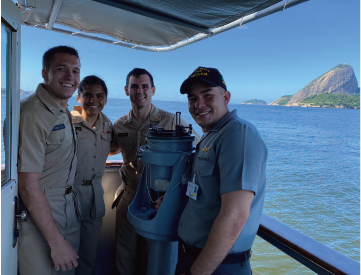
Midshipmen catching a ride on a YP along the coast of Rio